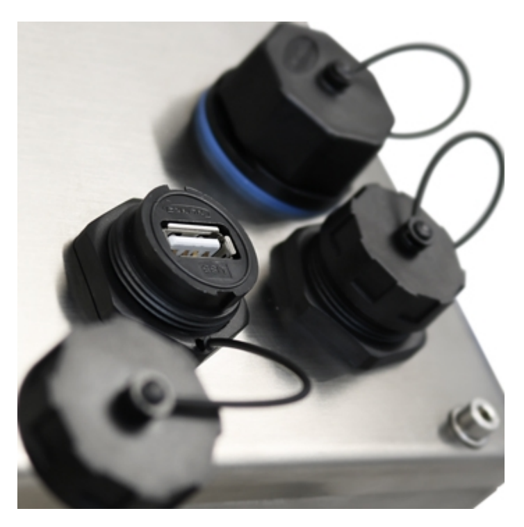
Waterproof communication ports