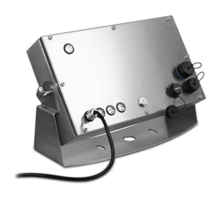
Rear panel configured for extra outputs