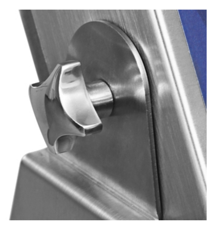
STAINLESS steel inclination adjustment system