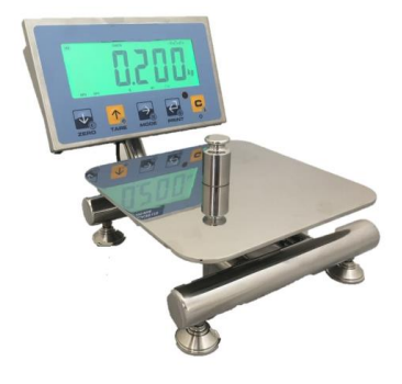
IP 67/68 Protection