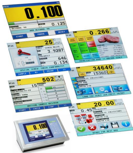
Bespoke Design Screens