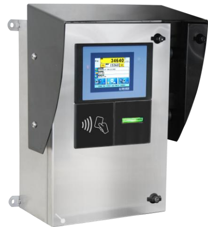
Driver Operated Terminals