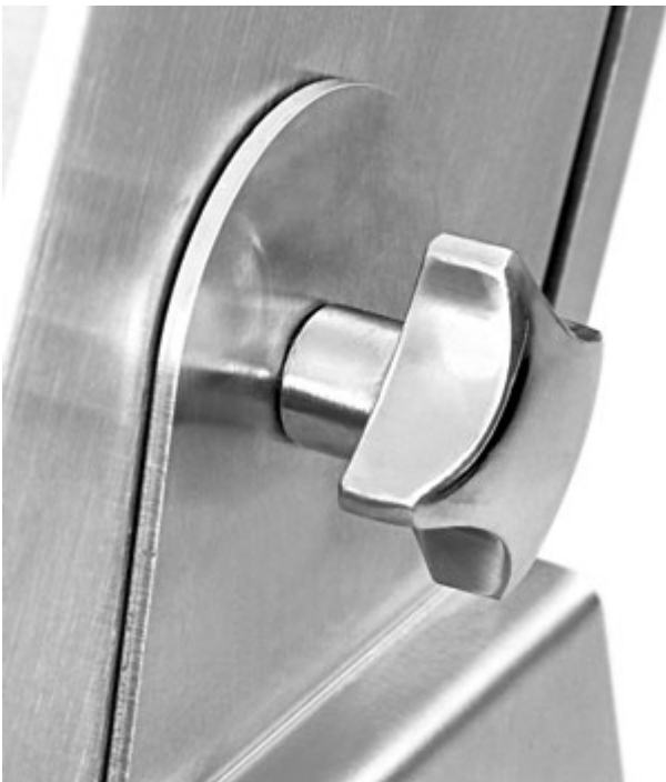
STAINLESS steel inclination adjustment system