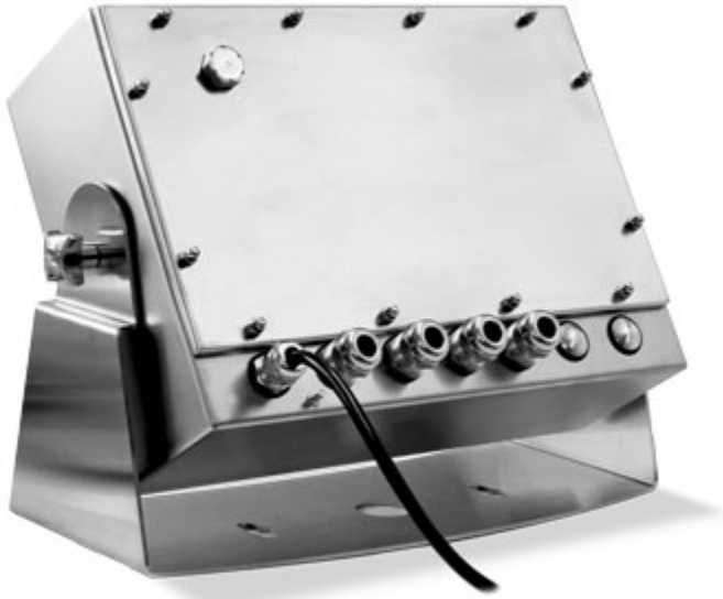
Rear panel configured for extra outputs