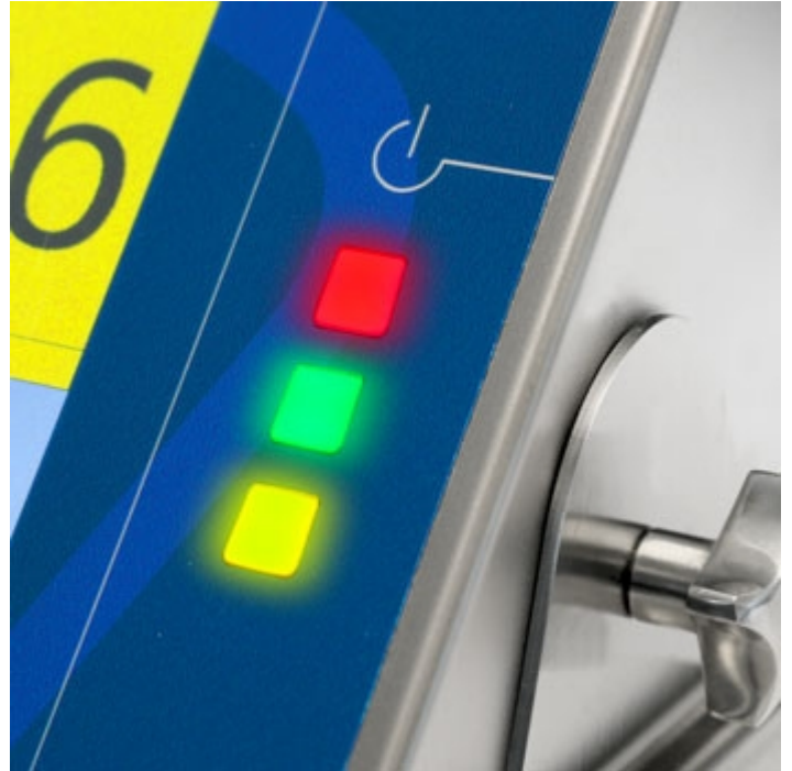
High brightness LED crosslight.