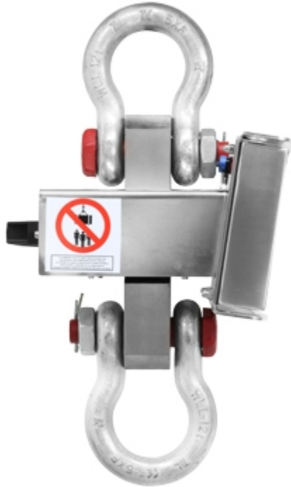
Crane scale MCW09: side view