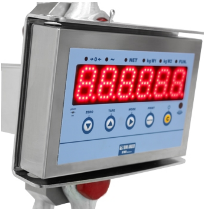
Crane scale MCW09: extra-bright 40mm display