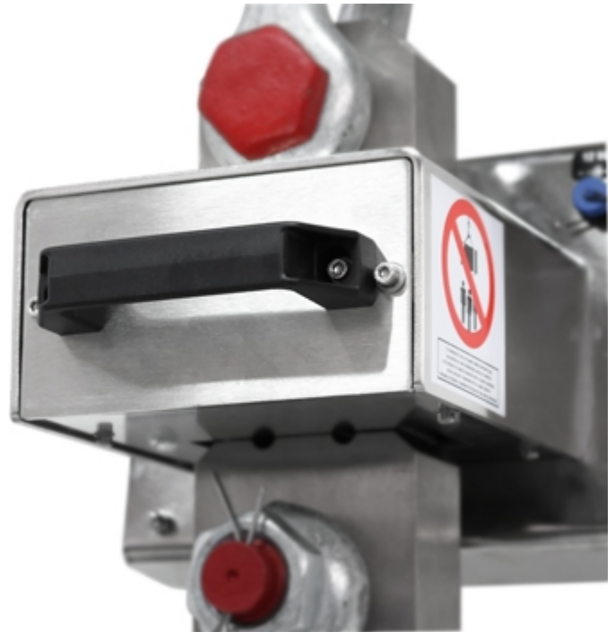
Crane scale MCW09: extractable battery view